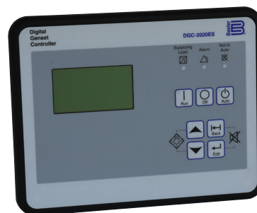
DGC-2020 DIGITAL CONTROLLER