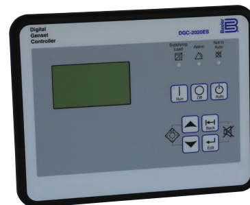
DGC-2020 DIGITAL CONTROLLER