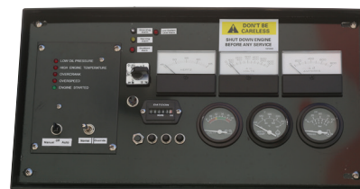
ANALOG CONTROL PANEL