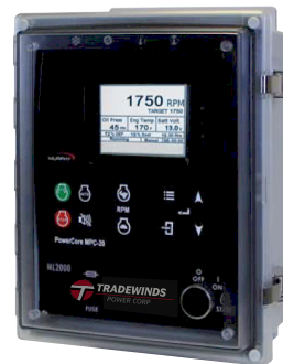
MPC-20 ENGINE CONTROLLER (Available on remote stand)