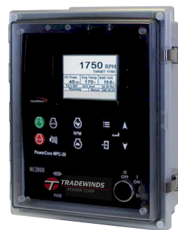
MPC-20 ENGINE CONTROLLER (Available on remote stand)